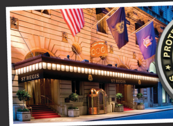
St. Regis Hotel, NY

First, email your ideas to one of our dedicated sales representatives. From there our talented artists can create compelling artwork out of almost anything!