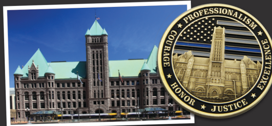
City Hall Minneapolis, MN

First, email your ideas to one of our dedicated sales representatives. From there our talented artists can create compelling artwork out of almost anything!